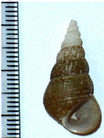
M. doriae ( Annandale 1918)