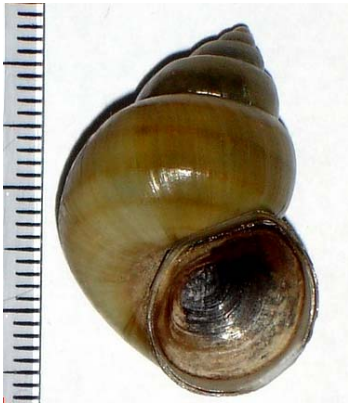
B. bengalensis (Lamarck 1822)